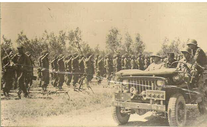
6 Jul 44-Collemezzano Area Italy-Secretary of War Henry L. Stimson and Lt Gen Mark W Clark & C.G 34th Div passing men of the division