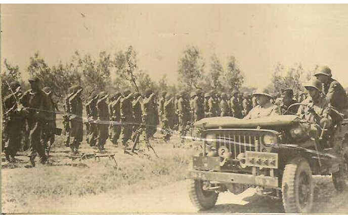
6 Jul 44-Collemezzano Area Italy-Secretary of War Henry L. Stimson and Lt Gen Mark W Clark & C.G 34th Div passing men of the division