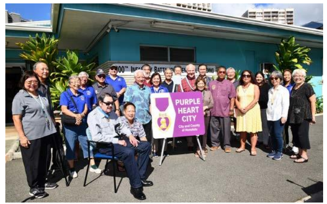
Purple Heart City sign dedication ceremony at the 100th Infantry Battalion Veterans (Club 100) Clubhouse.

https://www.100thibv.org/post/100th-purple-heart-city-sign .”