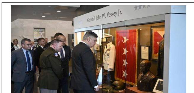
Croatian President Zoran Milanovic visits the Minnesota National Guard's 34th Infantry Division Headquarters at Arden Hills on Sept. 26, 2025.