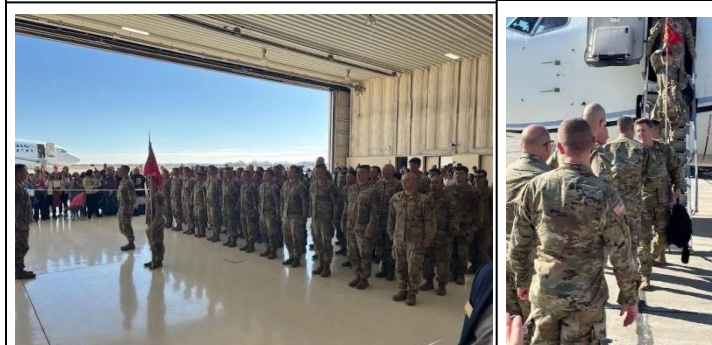
Soldiers from the 1-113th Cavalry Squadron arrive at 185th ARW in Sioux City, Iowa.