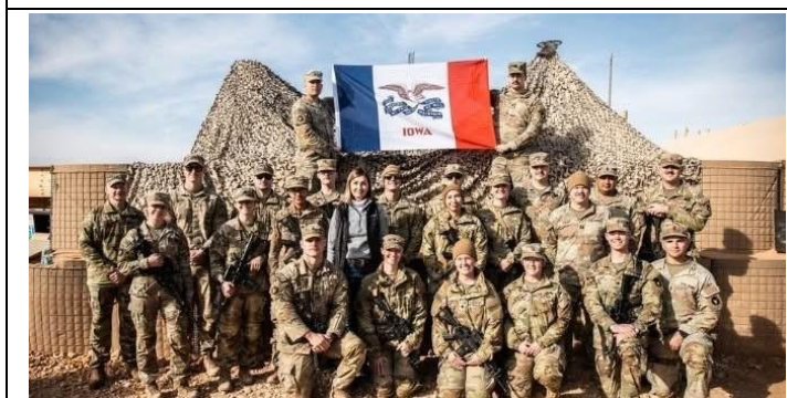
Governor Kim Reynolds’s January visit to the Middle East to visit Soldiers from 2nd Brigade, 34th Infantry Division, Iowa Army National Guard in Syria, Jordan, Iraq, and Kuwait.